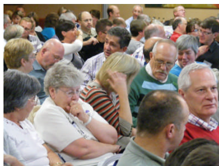
Discussion Time at Seminar 1